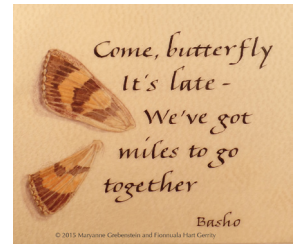
Calligraphy & Painting on Vellum