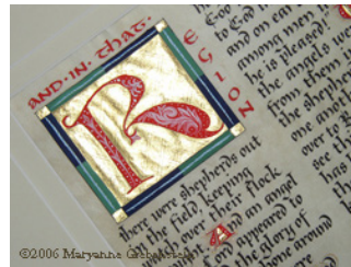
Gilded Versal Cap