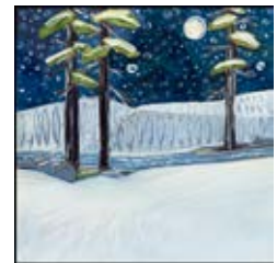
Tracy Finn Exhibit