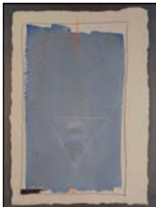
Hélène Falcon Exhibit