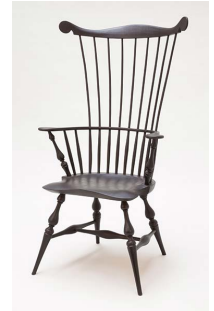
Handmade Windsor Arm Chair